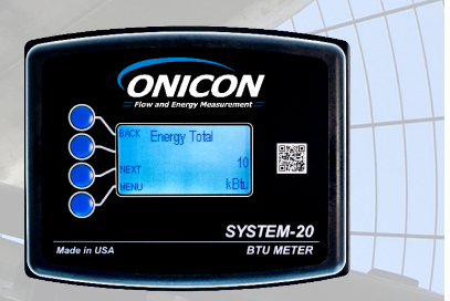
System-20 BTU Meter