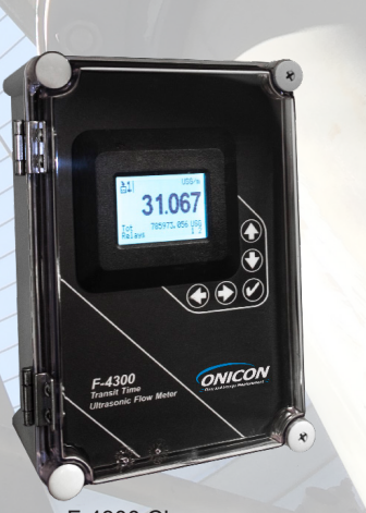
F-4300 Clamp-on Ultrasonic Flow Meter