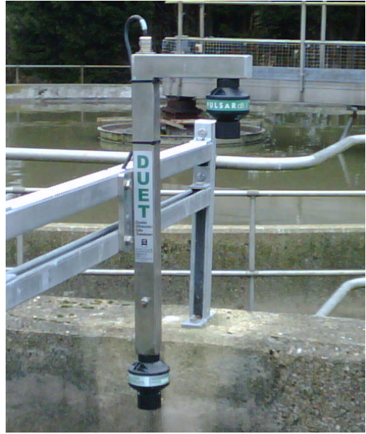
DUET Transducer in a Wastewater Application