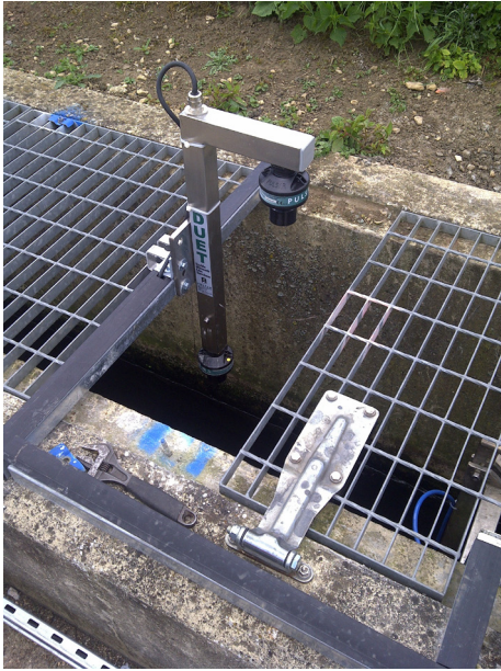
DUET Transducer in a Wastewater Application