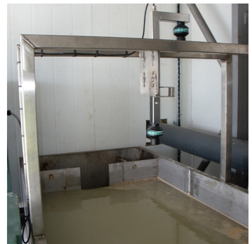
DUET Transducers Monitoring Plant Effluent

UltraLog can program the FlowCERT data logging facility and download any data stored in the unit so that it may be interrogated, viewed, and stored.