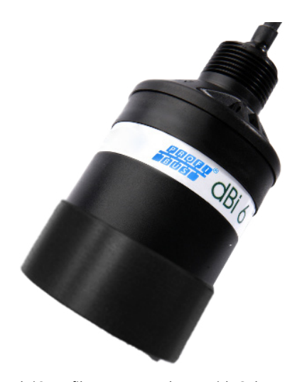
dBi6 Profibus PA Transducer with Submergence Shield.

dBi Profibus PA Transducers are highly developed ultrasonic level measurement devices that provide non-contacting level measurement for a wide variety of applications in both liquids and solids. Their unique design gives an unrivaled performance in echo discrimination and accuracy in a Profibus PA device.