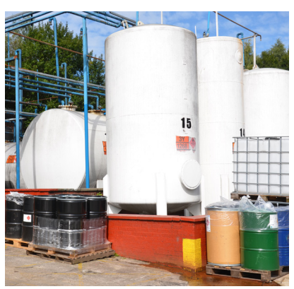
An example of tank level measurement.