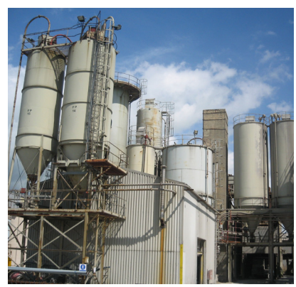
An example of silo level measurement.