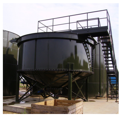
Liquid Tank Level Monitoring