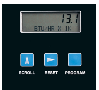
Smart button technology simplifies menu page navigation

Serial Communications - Optional: Provides complete energy, flow and temperature data to the control system through a single network connection, reducing installation costs.