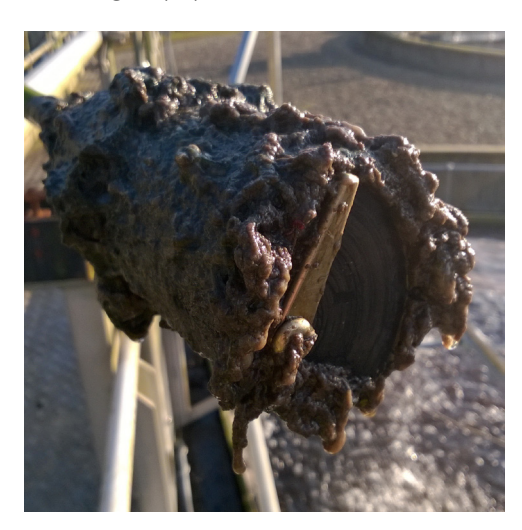
Viper transducer doing it's job!