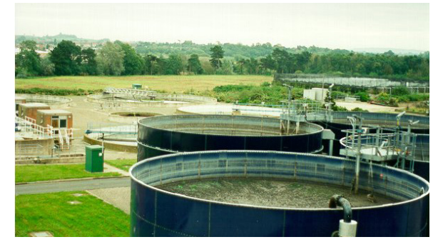
Sludge settlement tanks at a Sewage Treatment Works.

Sludge Finder 2 is designed to be maintenance-free. Sludge Finder's Viper transducer is a single beam ultrasonic unit immersed just below the liquid surface. A wiper blade sweeps the transducer face, ensuring that it remains clean. The Viper transducer may be positioned up to 200 m (656.2 ft) from the control unit and has a measurement range of 300 mm to 10 m (11.8 in to 32.8 ft). Accuracy is 0.25% of the measured range. A tight 6-degree beam angle and sophisticated echo processing algorithms make sure that Sludge Finder 2 deals with difficult tanks and rotating equipment with ease.